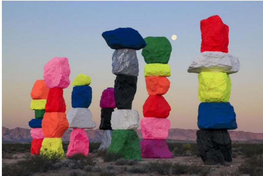
Ugo Rondinone - Seven Magic Mountains , 2016

widely known for his large-scale land art sculpture, particularly Seven Magic Mountains - seven totems consisting of large stones, stacked 32 feet high and painted in fluorescent colours. His sculpture Liverpool Mountain is currently on show outside Tate Liverpool until 2023. Ugo is also a poet, collector and curator.